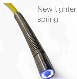
New tighter spring

For more information please click here - https://youtu.be/xFWKEWdz44A