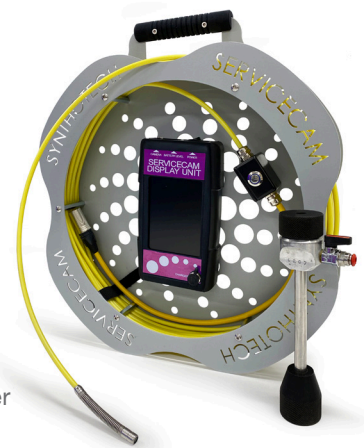
New tighter spring