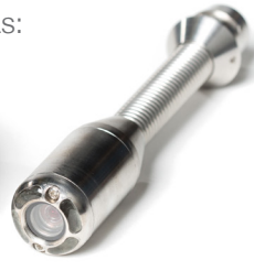
Series 200 (24mm)