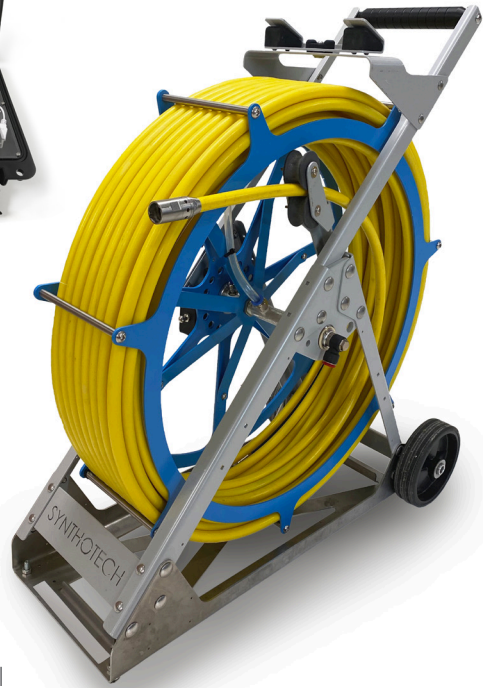
The WExTech mains coil

Choice of recordable or non-recordable display units.