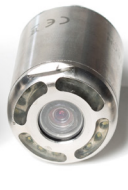
Series 300 (34 & 30mm)