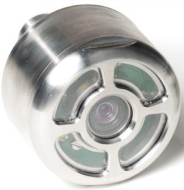
Series 400 (49mm)